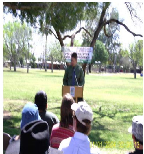
Dedication of CPES DTA Plaque at McCormick Park 4/27/09

The sites met at the park for the presentation of a plaque and to share a picnic lunch and snacks. Those attending received T-shirts and lots of thanks and praise.